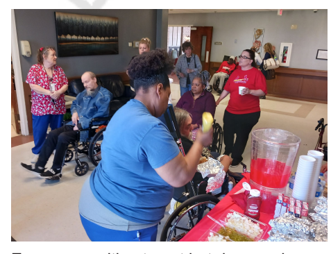
Everyone waiting to get hot dogs and other treats for Cardinals' opening day

We celebrated Cardinals' opening day with grilled hot dogs, peanuts, cracker jacks, and plenty of other goodies. The Cardinals game was on in the activity room. We played balloon baseball and had baseball trivia.