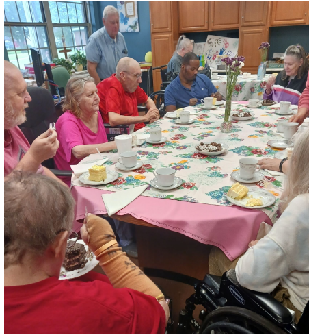
Residents enjoying their Bible study tea party.

Our Wednesday Bible study group held a tea party along with their Bible study. Residents really enjoyed the party.