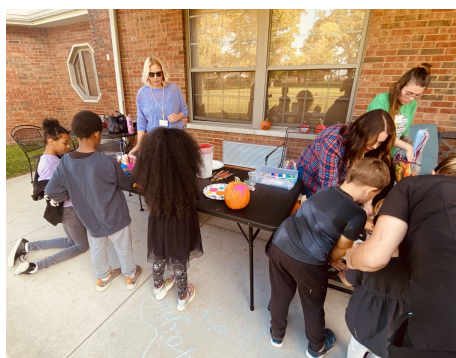
Decorating pumpkins at our Fall Fest.