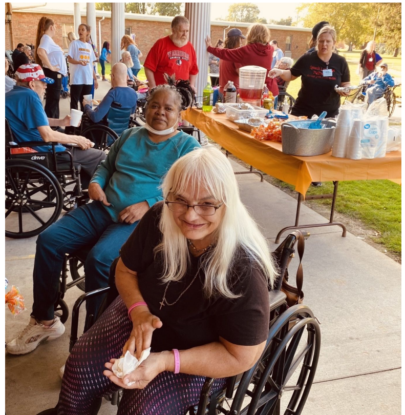
Residents, staff and family enjoying our annual Fall Fest

Our annual Fall Fest was a great success. Residents, their families, staff, and their families all came to enjoy a wonderful night on our patio. We grilled, enjoyed s'mores, played games, got (temporary) tattoos, decorated pumpkins and enjoyed great conversations. Madison County Fair Queen and Madison County Jr. Miss also attended and took pictures with everyone. A great time was had by all.