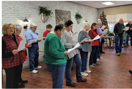
Hope Lutheran Church