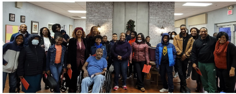
New Jerusalem SDA

Thank you SO much to every group that took time to come visit!