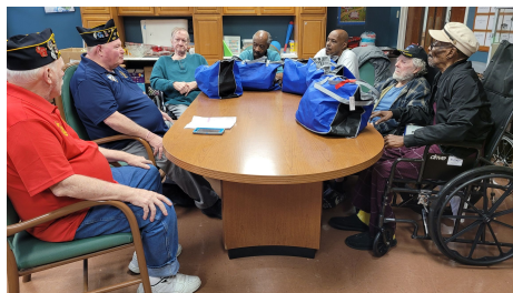
American Legion Post 307 with our veterans.