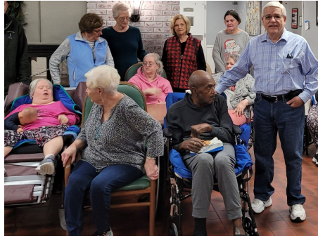
Members of Hope Lutheran with our residents!