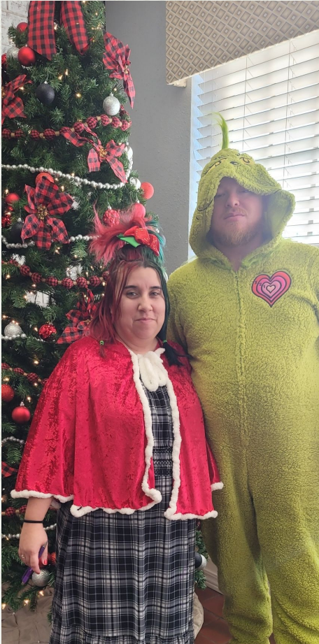
Grinch and Cindy Lou Who