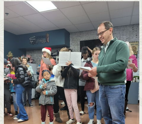
Grace Baptist Church