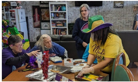
Enjoying King Cake.