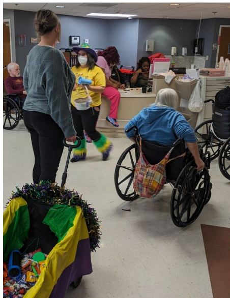
Mardi Gras Parade going through the hall. Everyone enjoyed seeing the craziness.