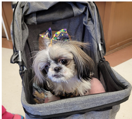
Fufu the dog came to be in our parade.