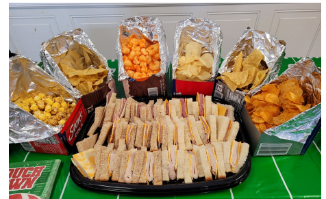
Super Bowl Snack Stadium