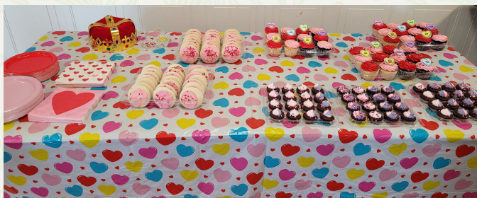
Valentine's Day treats!